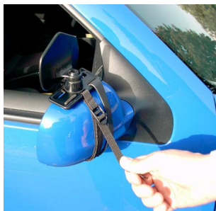
4. Tighten the textile retaining belt.