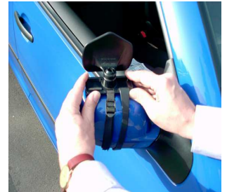
3. Push the upper restraint system with the mirror above the upper edge of the rear view mirror of the car. The first time of installation adjust the synthetic rubber restraint system to the right length to ensure a stable hold.