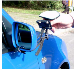
2. The lower plastic mounting needs to be hooked into concentric at the lower mirror edging.