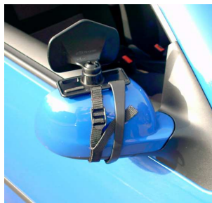
5. Clamp the end of the textile strap under the synthetic rubber restraint system.