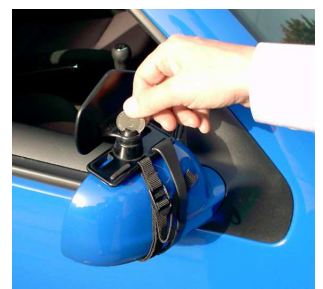
6. The screw to fix the ball joint can be unscrewed with a coin to ideally justify the mirror in all directions. Then tighten again.