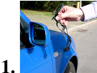
1. Take hold of mirror at ball joint.

Please follow this instruction sheet closely and point by point.